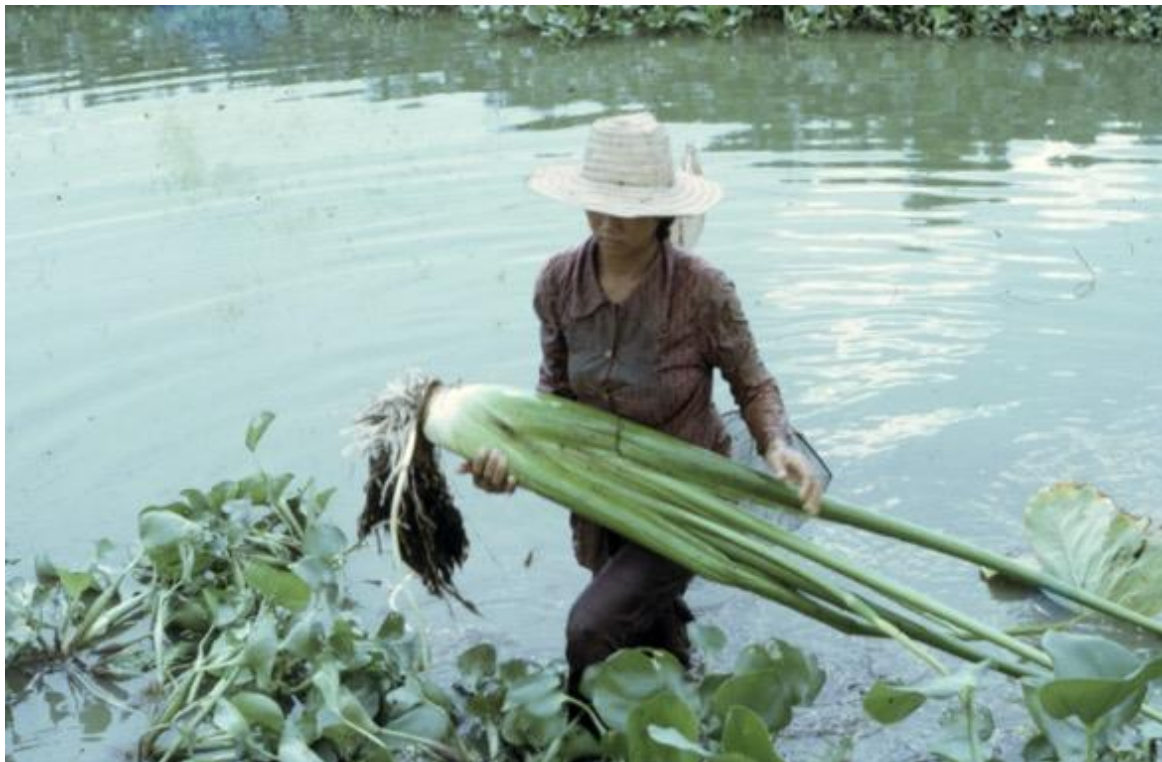
Fig. 9 Wild taro growing beside the road from the airport to Bangkok city in August 1974. Plants that were flowering were photographed, red ripe seed heads collected, and the seed placed in tissue culture at Rothamsted Research, and sent to Solomon Islands.

This was an unexpected turn of events. I stopped the taxi where some women were clearing taro and water hyacinth from the canal and, with gestures and the help of the taxi driver, asked for a plant with flowers (Fig. 9). This was brought, and then another with fruits. I gave the perplexed women something for their troubles, took the seed to Bangkok, cleaned it from its fleshy pulp, and in the UK presented the seed to Roger Plumb at Rothamsted Research. Roger was helping us sort out the viruses and was as excited with the find as I. No one had reported on taro seed up till then, and neither he nor I knew how to grow them.