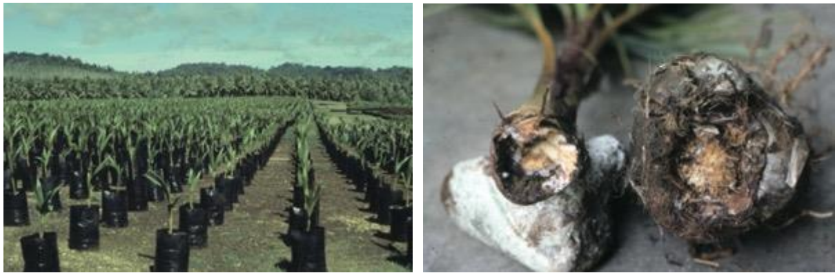
Fig. 10 Coconut seedling in the nursery at Levers Pacific Plantation, Yandina (left), were struck by a rare boll rot disease (right) only recorded previously from East Africa. Stems broke at the junction between petioles and top of the seednut. Such was the need to find a cure, a vehicle donated IFS for taro research was released to the plant pathology section.

As plant pathologist, I had to immediately investigate the problem, and for that I needed a vehicle. The IFS Toyota truck was duly delivered to Dodo Creek Research Station, and my work now concerned coconuts as well as taro.