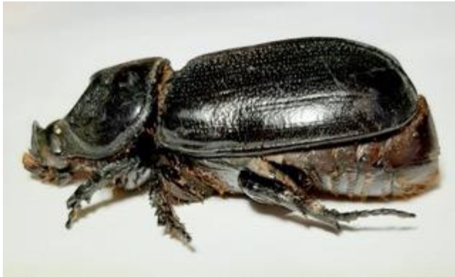
Fig. 18 Adult female Oryctes rhinoceros . The horn of the male is larger. The length of this beetle is 4.3 cm, others can be larger. The beetle bores through the base of the fronds into the crown to macerate still folded leaves and feed on the juices. Usually, the palms are not killed, except when number are high and the growing point is damaged. (Image kindly provided by Mani Mua, Pacific Community, Sigatoka Research Station, Fiji).

Follow-up work by AgResearch Ltd. maintained that the Guam or G-strain beetles could be distinguished from beetles descended from the original introductions to Fiji, Samoa, Tonga and elsewhere in the Pacific (the so-called Pacific P or S strain) based on differences in the mitochondrial COI gene 70 . The P strain is still considered to be susceptible to OrNV infection whereas the G strain is not 71 .