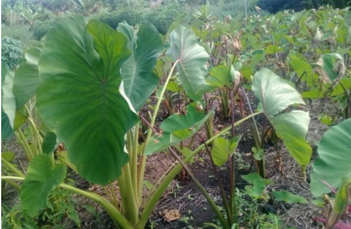
Fig. 3 The impact of taro leaf blight is to defoliate plants: they have 3 to 4 leaves instead of 6 to 7 on a healthy plant. The plant in the foreground is a blight-tolerant breeders' line, either the "Agriculture taro" from Solomon Islands or a Samoa variety, for comparison. It is a line bred for tolerance to taro leaf blight. The variety in the background with dark leaf stalks is a local susceptibility variety. (Field of Osanti Ludawane, Takwa, north Malaita, 2019. Image kindly provided by Pita Tikai, Kastom Gaden Association).