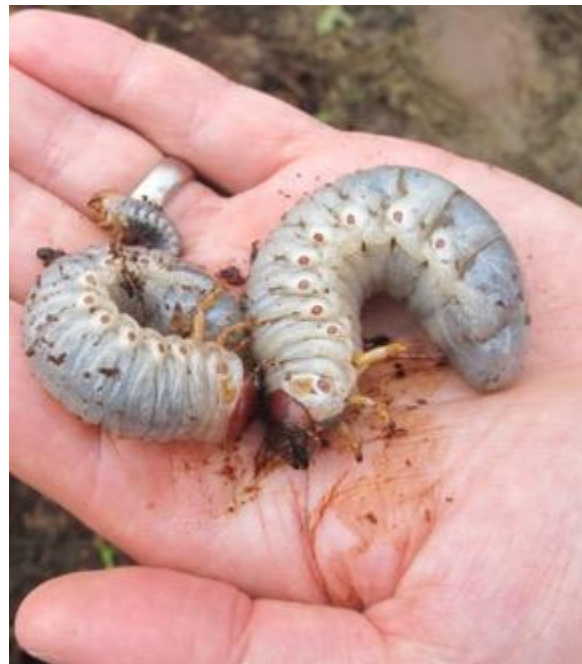
Fig. 23 As with coconuts, rotting oil palm trunks are excellent breeding sites for the beetles. Large numbers of larvae occur at all stages of development (left). The larvae of Oryctes rhinoceros larvae are typically C-shaped (right)