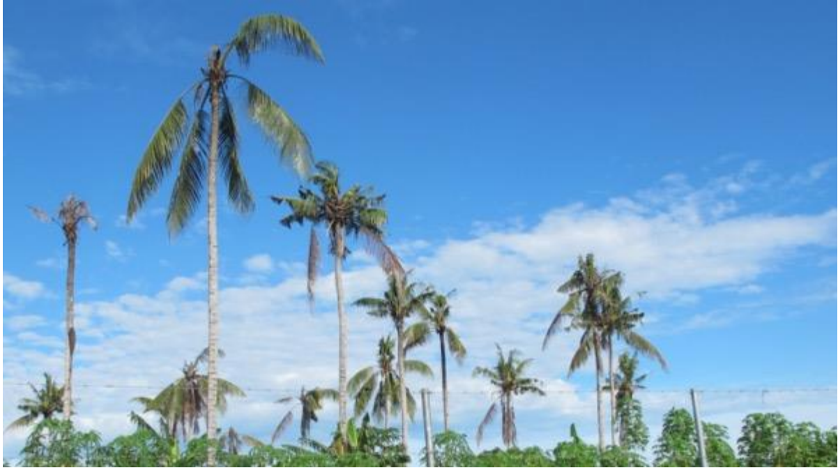
Fig. 19 Extreme damage to mature coconut palms by Oryctes rhinoceros near Honiara, Guadalcanal in June 2017. Typical symptoms when populations of beetle are high.