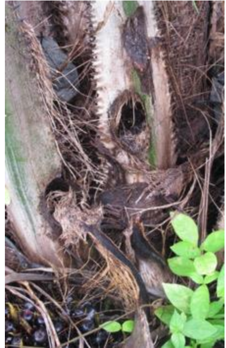
Fig. 22 Two-year-old oil palm seedling attacked by Oryctes rhinoceros causing similar symptoms as occur on coconuts (left). The beetles bore through the base of the fronds to enter the crown (right). The low mound-like object behind the central palm is an old windrowed oil palm covered in the ground legume, Pueraria phaseoloides . These rotting trunks are excellent breeding sites for the beetles.