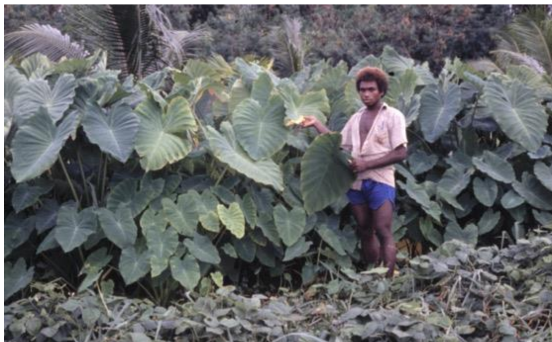
Fig. 12 The first hybrids between the Bangkok and a Solomon Island variety were grown out on land previously occupied by Dala Research Station. Malaita Province had retained the lease of the former research station, and because of that the plant pathology section was able to keep staff there. The landowners were generous in their support, allowing land to be used for root crop experiments and showing interest in the work.

status of root crop and needs. At the end of the mission, consultants and country representatives met in Fiji to discuss current research activities and national priorities 27 .