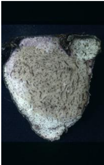
Fig. 4 A corm cut in half to show the hard dry rot caused by Phytophthora colocasiae , the cause of taro leaf blight. In Solomon Islands, the rot appears after harvest, presumably from spores infecting damaged corms as the young shoots or suckers are ripped off plants as they are pulled from the ground. Such symptoms have not been reported from other countries, and not all scientists agree that these rots occur. For instance, it has not been seen in Hawaii and recent surveys in Samoa of blight-tolerant taro suggest that it is rare or absent. The question of whether the leaf blight pathogen is corm-borne or not is important and needs to be resolved: it is of concern to biosecurity authorities in countries free from blight, but which import taro from countries where the disease occurs. Recent work by Plant and Food Research, Auckland, New Zealand, funded by ACIAR suggests that the blight-tolerant breeders' lines do not harbour infections in their corms. Another plus from the breeding TaroGen breeding program!