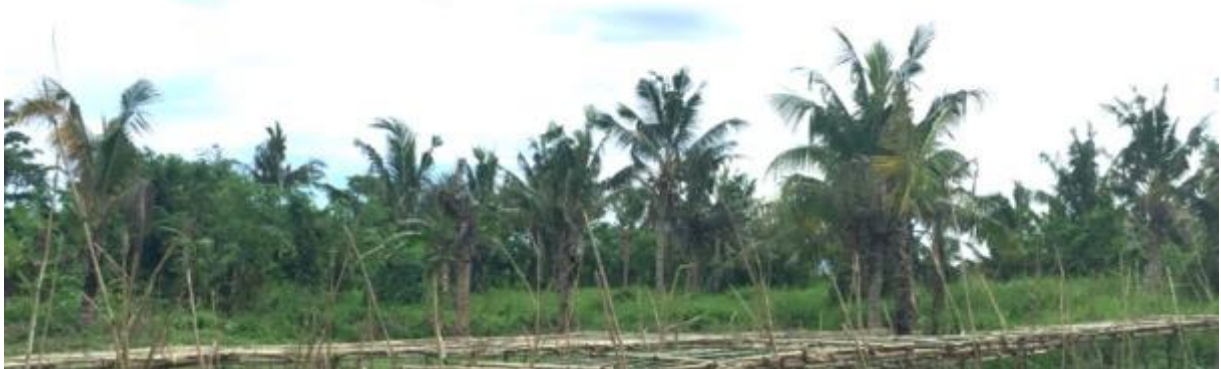
Fig. 20 Truncated fronds with missing wedge-shaped areas are typical symptoms of coconut fronds damaged by Oryctes rhinoceros . The damage is done as the beetles bore into the crowns to feed on the shoots. This was a ‘hotspot’ area west of Honiara, and produced large populations of larvae from rotting palms (see Fig. 20)