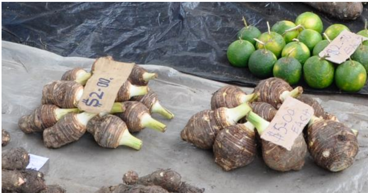
Fig. 6 Taro corms (centre) in two piles according to size in the Honiara market. The older leaf stalks and roots have been removed and the corms scraped. It is usual to leave the shoot attached to the corm to preserve self-life. Invariably, buyers will cut off the leaf stalks (which contain the growing point) retaining about a centimetre of corm at the base, and plant them. Elsewhere in the region, the leaf stalks are about 50 cm long, and depending on the country and traditional practices, several are tied together for ease of carrying to and from the market.