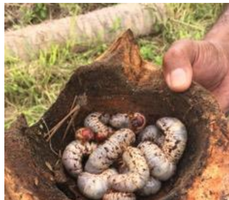
Fig. 21 Larvae of Oryctes rhinoceros at different development stages in rotten coconut trunk (left), and mostly mature larvae (right). After the trunks die they rot quickly and become preferential breeding sites for Oryctes rhinoceros . Both standing and fallen palms are infested equally.