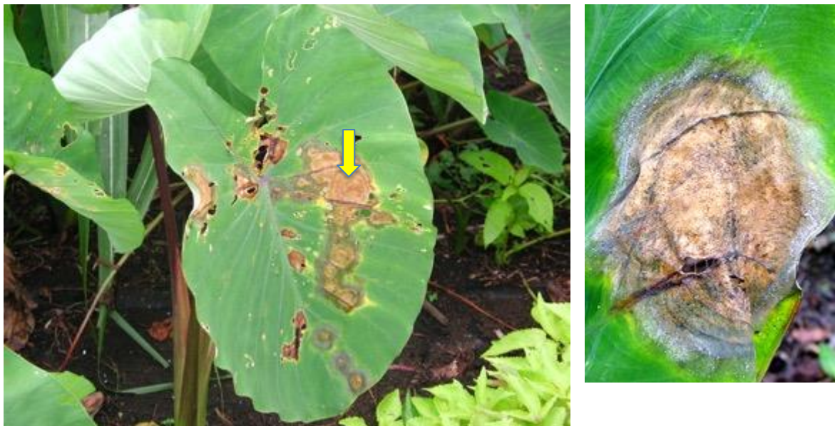
Fig. 7 Spores from the initial infection (arrowed) have dribbled down the leaf in rain or dew and caused secondary infections below (left). The spores develop at night-time appearing clearly as a white halo around the spots in the early morning, especially noticeable on the top of the leaf (right).

At this point, it is important to understand how taro leaf blight works – that is, its epidemiology. Spores form in the cool early morning as a white fuzz at the margins of brown spots (Fig. 7). This is significant: dew collects the spores from the spots and as it dribbles downwards over the leaf it releases them from secondary infections. Some dew with spores reaches the edge of the leaves and drips over the edge infecting younger leaves below. In this way, the disease ticks over often not doing much harm. Most of the spores are short-lived; they are fragile and by 10 am most if not all have shrivelled in the sun, and have died.