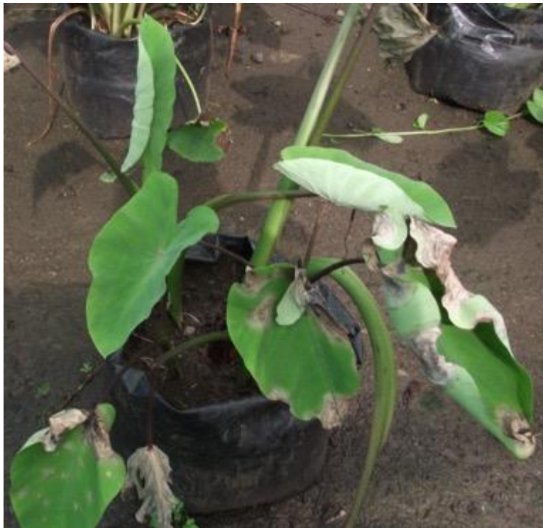
Fig. 17 The vulnerability of taro in Pacific island countries. The image show a taro from Vanuatu introduced to Samoa in order to improve the quality of corms of the breeders' lines. This and other varieties were found to be extremely susceptible, just as susceptible as those grown in Samoa and struck down by the disease in June 1993. A reminder of the destructive nature of taro leaf blight and the need to distribute taro leaf blight-tolerant breeders' lines to farmers as soon as possible.

Fiji has most to lose, of all the countries of the region, if taro leaf blight were to be introduced. It has a taro industry that is valued at around F$117 million, of which exports are put at F$23 million. The country has not moved to protect that industry from the disease. The new taro leaf blight tolerant taro have not reached farmers, except for a few mentioned that are part of its Fiji Taro Industry Plan 2017 58 .