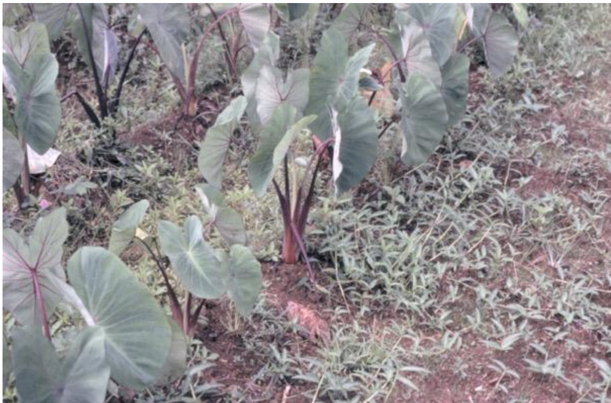
Fig. 14 Cultivar Toantal growing in Pohnpei, Federated States of Micronesia. This variety was tolerant to taro leaf blight even under very high rainfall and temperature conditions which defoliated Fiji introductions. This variety and other Pohnpei varieties – Kosrae, Pastora and Pwetpwet – were introduced to Samoa and used in the breeding program, along with a variety from the Philippines and one from Palau.

Later, varieties were collected from Palau and also proved a useful source of tolerant taro for the breeding program in Samoa