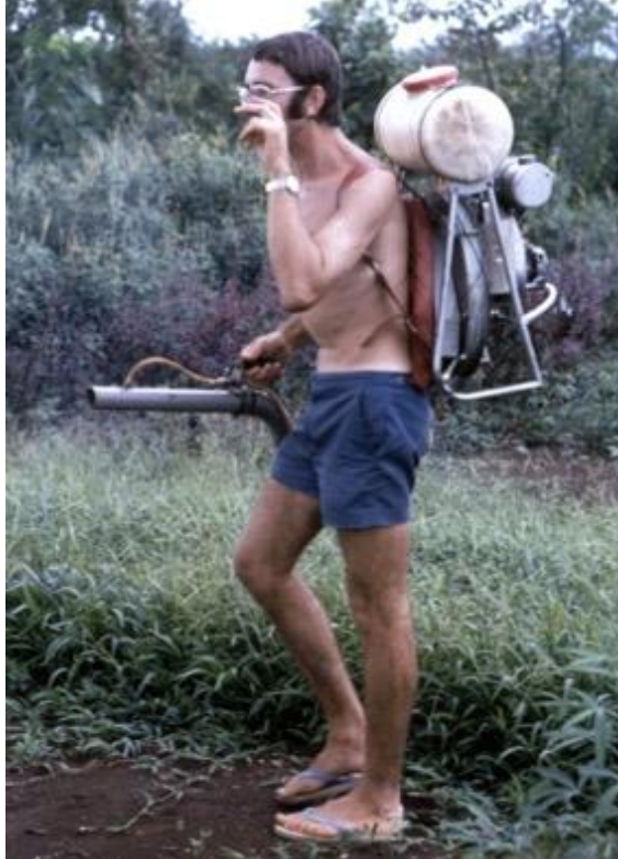
Fig. 8 Fungicides not plant breeding was the order of the day! Here the author, at a considerably younger age, demonstrates everything not to wear when applying a pesticide with a mistblower. Note the total lack of PPE (personal protective equipment). Plant breeding would have been so much safer!