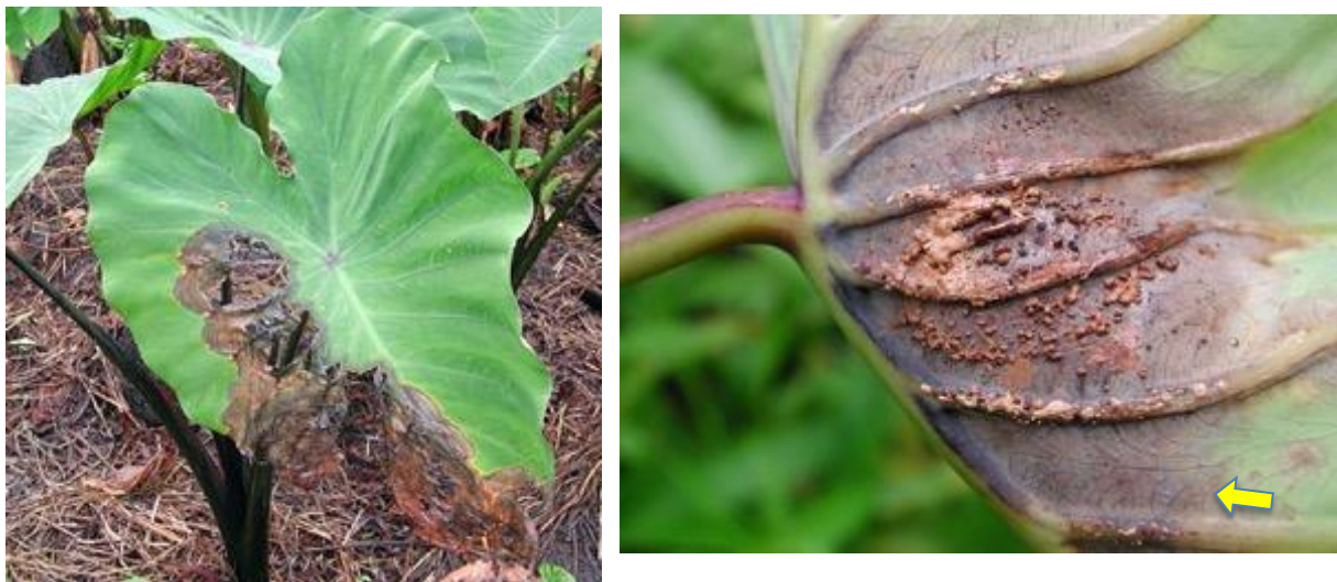
Fig. 2 Taro leaf blight. The reaction on a very susceptible variety in Samoa (left); and the underside of a leaf of an equally susceptible variety in Malaita, Solomon Islands (right). The arrow is pointing to an area of white spotting at the margin of the infection where spores form at night. See also Fig. 7 for upper surface. Note, reddish droplets in the centre of the rot; this is sap that has oozed from the damaged leaf and congealed into hard pellets.

Although the work that I was employed to do in Solomon Islands involved two look-alike pathogens they behaved quite differently, even though they both wreaked havoc on their respective hosts. Both love wind and rain to aid spore dispersal, and they both destroy their hosts at alarming speed. But they differ: the one on cocoa rots the pods containing the important beans - the source of chocolate - whereas the other on taro destroys the leaves (Figs. 2&3), and also the corms (Fig. 4). In their different ways they are both very dangerous: without leaves there can be no greens or starchy corms to eat (Figs. 5&6); without pods there would be no cocoa, a traded commodity worth billions. In different ways, both pathogens challenged people's food security.