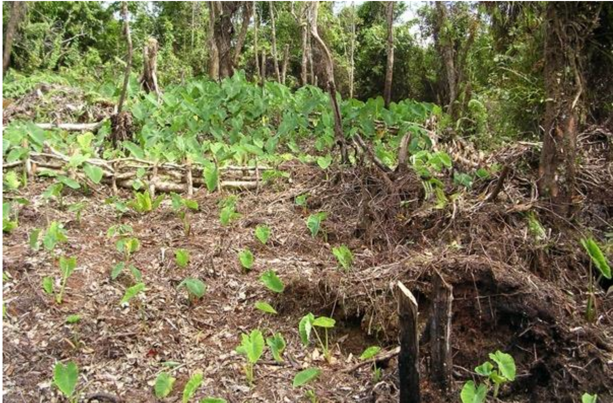
Fig. 5 Taro growing in patches cut from the bush in Solomon Islands. Here, three successive plots have been planted with the oldest near the trees at the back of the photograph. Plots are often separated by logs, or here a low fence. When plants are well-established with 5-6 leaves, the youngest are often taken and cooked for leafy greens. It is an important vegetable throughout Pacific island countries.